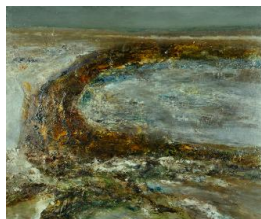
Title: Along the Shore (A Special Place) Date: 1989 Primary Maker: O'dowd, Gwen Medium: Oil on hardboard