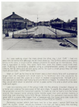
Title: Griff Was Here (A Special Place) Date: 1989 Primary Maker: O'Kelly, Mick Medium: Photograph