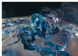
Title: Burren Nights (A Special Place) Date: 1989 Primary Maker: Cooke, Barrie Medium: Oil on canvas