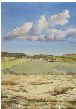
Title: An Aspect of Donegal (A Special Place) Date: 1989 Primary Maker: Clarke, Carey Medium: Watercolour