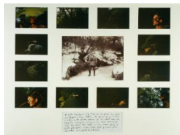
Title: The First and the Last Photographs (A Special Place) Date: 1989 Primary Maker: Parr, Martin Medium: Photograph