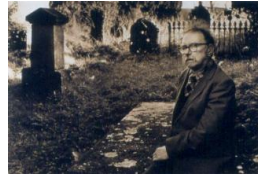
Title: Poet in a Medieval Churchyard (A Special Place) Date: 1989 Primary Maker: Minihan, John Medium: Photograph