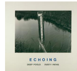
Title: Echoing (A Special Place) Date: 1989 Primary Maker: Doherty, Willie Medium: Photograph