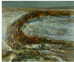
Title: Along the Shore (A Special Place) Date: 1989 Primary Maker: O'dowd, Gwen Medium: Oil on hardboard