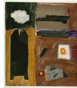
Title: Spanish Place, Orzola, Lanzarote (A Special Place) Date: 1988 Primary Maker: O'Malley, Tony Medium: Mixed media