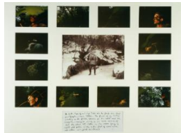
Title: The First and the Last Photographs (A Special Place) Date: 1989 Primary Maker: Parr, Martin Medium: Photograph