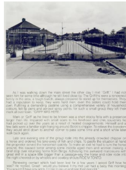
Title: Griff Was Here (A Special Place) Date: 1989 Primary Maker: O'Kelly, Mick Medium: Photograph