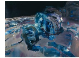
Title: Burren Nights (A Special Place) Date: 1989 Primary Maker: Cooke, Barrie Medium: Oil on canvas