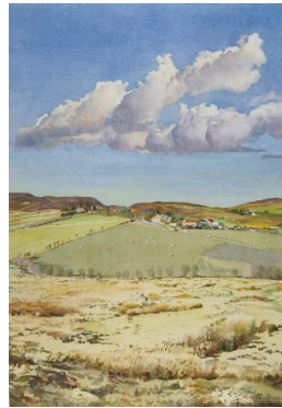
Title: An Aspect of Donegal (A Special Place) Date: 1989 Primary Maker: Clarke, Carey Medium: Watercolour