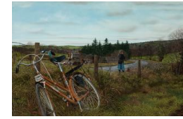
Title: Bus Stop Date: 1981 Primary Maker: Gale, Martin Medium: Oil on canvas