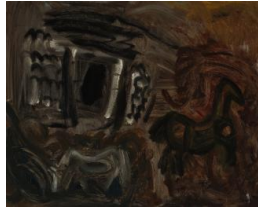
Title: Cave of the Firbolg Date: 1973 Primary Maker: Reid, Nano Medium: Oil on board