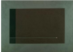
Title: Traverse, '84 Date: 1984 Primary Maker: King, Cecil Medium: Oil on canvas