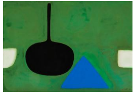
Title: Black Blue Green Date: 1969 Primary Maker: Scott, William Medium: Gouache & pigment on paper