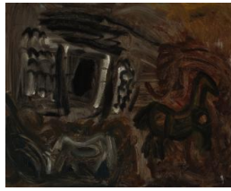
Title: Cave of the Firbolg Date: 1973 Primary Maker: Reid, Nano Medium: Oil on board