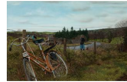
Title: Bus Stop Date: 1981 Primary Maker: Gale, Martin Medium: Oil on canvas