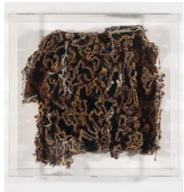
Title: Catacomb Date: 2004 Primary Maker: Mosse, Paul Medium: Mixed media