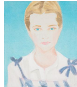
Title: Lily-White No.2 Date: 2006 Primary Maker: Browne, Gemma Medium: Acrylic on linen