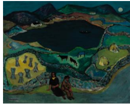
Title: The Black Lake Date: c.1940 Primary Maker: Dillon, Gerard Medium: Oil on board