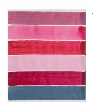
Title: Rosa 2