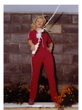
Title: Mississippi Goddam