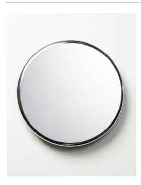
Title: Double Date: 2003