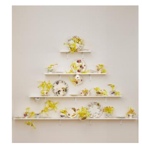
Title: Not the full story