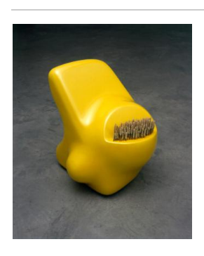
Title: Sunlight Date: 2004