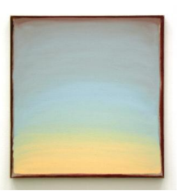
Title: Hope paintingabercromby place