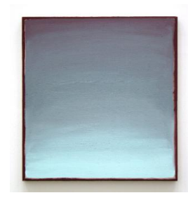
Title: Hope paintingstrolling home to you.