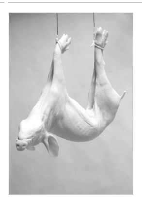
Title: Pig Date: 2008