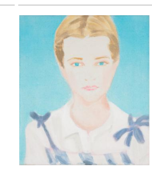
Title: Lily-White No.2