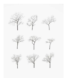
Title: Tree Museum (Grand Concourse Street Trees 149th -151st Street)