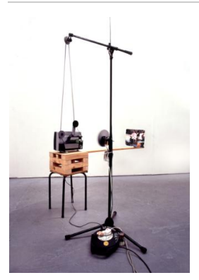
Title: Another day with song (3.35pm) Date: 2005