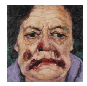
Title: Human Series No.