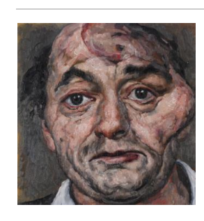
Title: Human Series No. 22