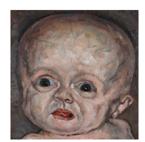
Title: Human Series No.