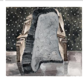
Title: Untitled Date: 2006

Primary Maker: Doran, Paul Medium: Oil on linen on