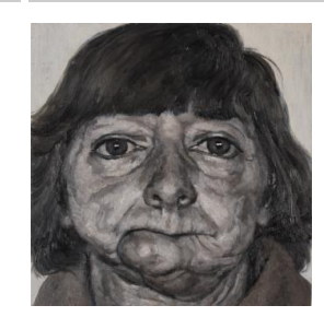
Title: Human Series No. 18