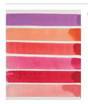
Title: Rosa 6 Date: 2005