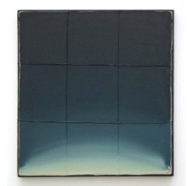
Title: Hope Painting-a grain of sand