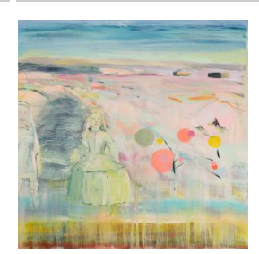
Title: Argentina Date: 2006