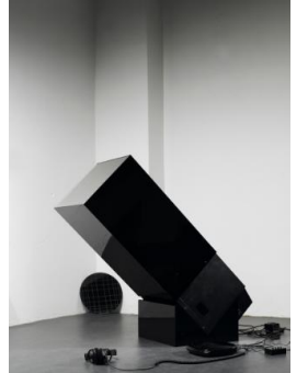
Title: The here and now /crystalline space Date: 2008