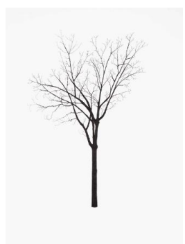
Title: Tree Museum (Grand Concourse Street Tree at 150th Street)