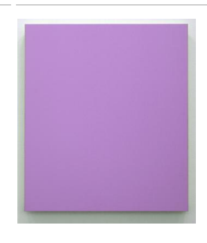
Title: Swell Date: 2005