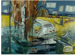
Title: The Last of the Trees Date: 1972 Primary Maker: McGuinness, Norah Medium: Oil on canvas