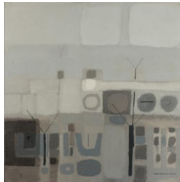
Title: Drumnasole Date: 1965 Primary Maker: Middleton, Colin Medium: Oil on board