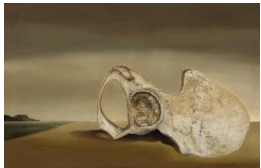
Title: Erosion I Date: 1970 Primary Maker: Simonds- Gooding, Maria Medium: Mixed media