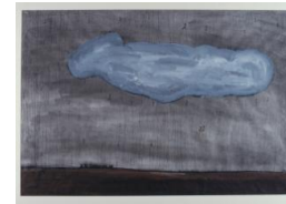
Title: Cloud (Jacob's Dream) Date: 1998 Primary Maker: Hall, Patrick Medium: Ink & acrylic on paper