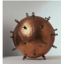
Title: Omniscience Date: 1994 Primary Maker: de Fouw, Remco Medium: Copper, brass, glass, water