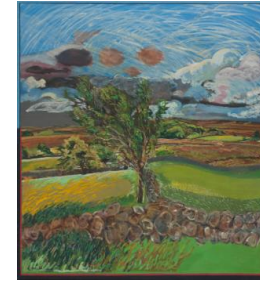
Title: Knockalough (Summer 1977) Date: 1977 Primary Maker: Bourke, Brian Medium: Oil on canvas