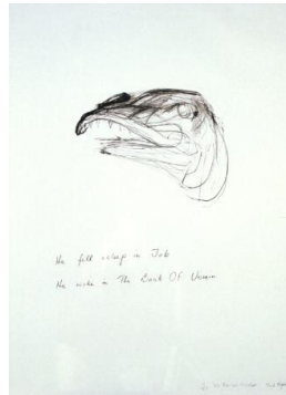
Title: The Great Irish Pike III 15/25 Date: 1982 Primary Maker: Cooke, Barrie Medium: Lithograph