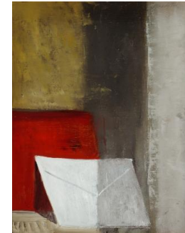
Title: Red Bin with Envelope Date: 1972 Primary Maker: Brady, Charles Medium: Oil on paper