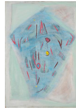
Title: Summer Kite Date: 1976 Primary Maker: O'Malley, Tony Medium: Oil on board