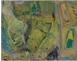
Title: Wreckage No.1 Date: 1966 Primary Maker: Reid, Nano Medium: Oil on board