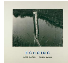
Title: Echoing (A Special Place) Date: 1989 Primary Maker: Doherty, Willie Medium: Photograph