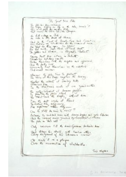
Title: The Great Irish Pike I 15/25 Date: 1982 Primary Maker: Cooke, Barrie Medium: Lithograph