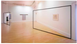
Title: 1 - "Arrangements" Date: 2012 Primary Maker: Burke, Karl Medium: Mild steel bar, matt black paint