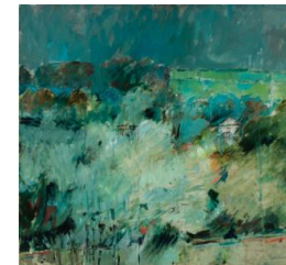
Title: Green Landscape Date: 1980 Primary Maker: Blackshaw, Basil Medium: Oil on canvas