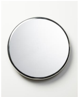
Title: Double Date: 2003 Primary Maker: Martin, Fergus Medium: Stainless steel ( 2 disks)