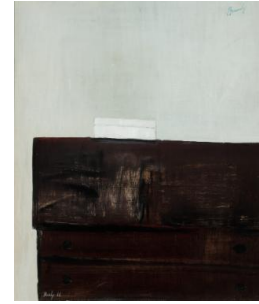
Title: Red Desk Date: 1966 Primary Maker: Brady, Charles Medium: Oil on canvas