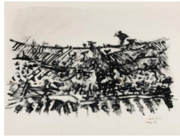
Title: Calary Date: 1964 Primary Maker: Souter, Camille Medium: Oil on paper