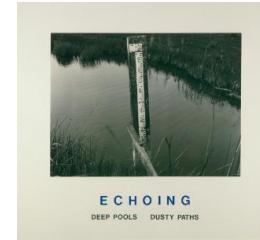
Title: Echoing (A Special Place) Date: 1989 Primary Maker: Doherty, Willie Medium: Photograph