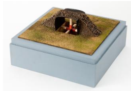
Title: Six Foot Deep Date: 1979 Primary Maker: King, Brian Medium: Mixed media