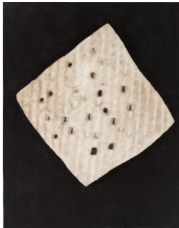
Title: Fiberglass Form in White on Black Date: 1967 Primary Maker: Brown, Deborah Medium: Relief fiberglass