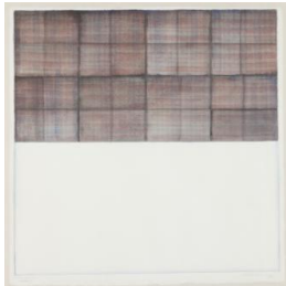
Title: Untitled II Date: 1977 Primary Maker: Lennon, Ciarán Medium: Tempera, pencil & watercolour