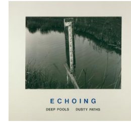
Title: Echoing (A Special Place) Date: 1989 Primary Maker: Doherty, Willie Medium: Photograph