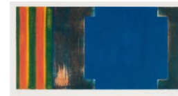
Title: Untitled 1/5 Date: 1995 Primary Maker: Kennedy, Brian Medium: Multi plate etching