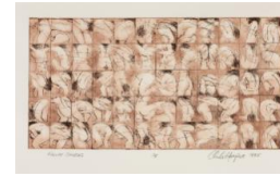
Title: Figure Stress 1/5 Date: 1995 Primary Maker: Harper, Charles Medium: Etching