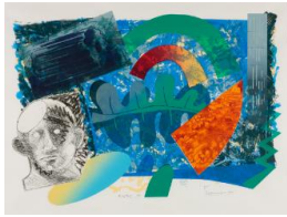
Title: Acanthus 1/5 Date: 1995 Primary Maker: Gravett, Terry Medium: Etching