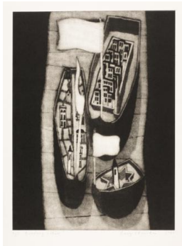
Title: Trading Cities 5/5 Date: 1995 Primary Maker: Staunton, Tracy Medium: Mezzotint