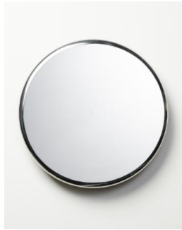
Title: Double Date: 2003 Primary Maker: Martin, Fergus Medium: Stainless steel ( 2 disks)