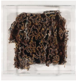
Title: Catacomb Date: 2004 Primary Maker: Mosse, Paul Medium: Mixed media