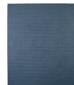
Title: Number 10 D.6 Date: 1986 Primary Maker: Lennon, Ciarán Medium: Oil on canvas