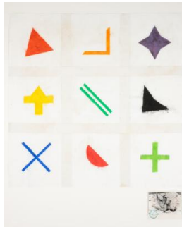
Title: Nine Symbols Date: 1981 Primary Maker: Rolfe, Nigel Medium: Mixed media