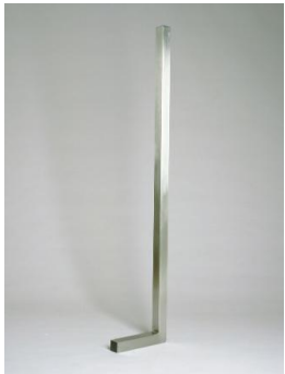
Title: Stand In Date: 1995 Primary Maker: Walker, Corban Medium: Stainless steel & cast glass