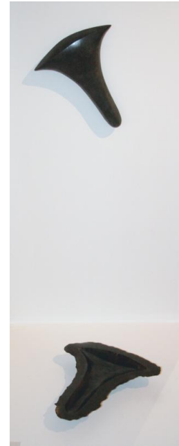
Title: Funnelling the Dish Date: 1988 Primary Maker: O'Connell, Eilis Medium: Bronze