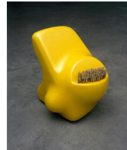
Title: Sunlight Date: 2004 Primary Maker: Hapaska, Siobhán Medium: Fiberglass, 2 pack acrylic paint, spent cartridges, wheat