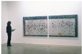
Title: Empty Sign (TU) Date: 2002 Primary Maker: McTigue, Eoghan Medium: Photographic prints on MDF