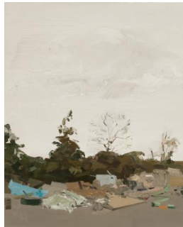
Title: Fir Tree and Dump Date: 2010 Primary Maker: O'hEocha, Mairead Medium: Oil on board