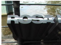
Title: Mine Are of Trouble Date: 2006 Primary Maker: Clarke, Declan Medium: Single channel DVD projection