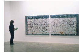
Title: Empty Sign (TU) Date: 2002 Primary Maker: McTigue, Eoghan Medium: Photographic prints on MDF