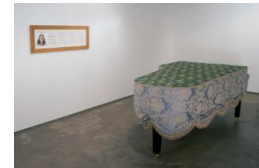
Title: Naked (add black to cobalt blue) in collaboration with Gerald Barry Date: 2001 Primary Maker: Jones, Finola Medium: CD/construction /dustcover/framed score /amplification