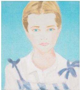
Title: Lily-White No.2 Date: 2006 Primary Maker: Browne, Gemma Medium: Acrylic on linen