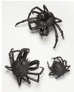
Title: Family Date: 2005 Primary Maker: Cross, Dorothy Medium: Cast bronze