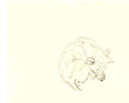
Title: Quiet Please 1/3 Date: 2005 Primary Maker: Nolan, Isabel Medium: DVD animation