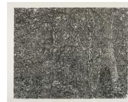
Title: Scene of the Crime, Wicklow Forest Date: 2006 Primary Maker: Coyle, Gary Medium: Charcoal on paper