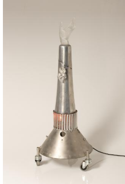
Title: Martha Date: 2000 Primary Maker: O'Shea, Mick Medium: Steel, aluminium, cast glass