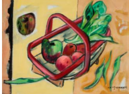
Title: September Date: 1977 Primary Maker: McGuinness, Norah Medium: Oil on canvas