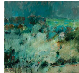
Title: Green Landscape Date: 1980 Primary Maker: Blackshaw, Basil Medium: Oil on canvas