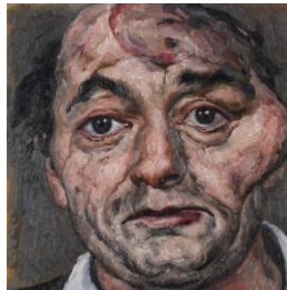
Title: Human Series No. 22 Date: 2000 Primary Maker: Wedge, Martin Medium: Oil on board