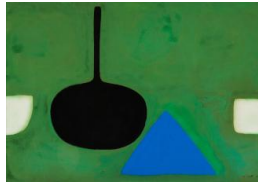
Title: Black Blue Green Date: 1969 Primary Maker: Scott, William Medium: Gouache & pigment on paper