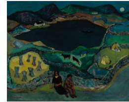
Title: The Black Lake Date: c.1940 Primary Maker: Dillon, Gerard Medium: Oil on board