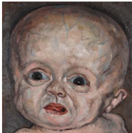
Title: Human Series No. 8 Date: 2000 Primary Maker: Wedge, Martin Medium: Oil on board