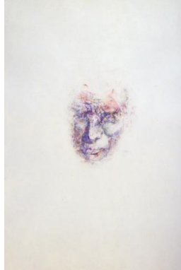
Title: Image of Samuel Beckett (Heroes) Date: 1987 Primary Maker: le Brocquy, Louis Medium: Watercolour on paper