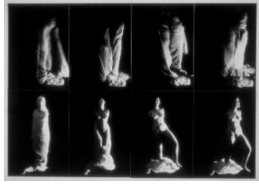
Title: Cutting the Ties that Bind (Heroes) Date: 1987 Primary Maker: Duffy, Mary Medium: Photograph