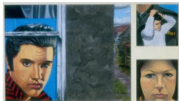
Title: The King's Birthday (Heroes) Date: 1987 Primary Maker: Gale, Martin Medium: Acrylic on paper