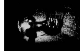
Title: Heroes (Heroes) Date: 1987 Primary Maker: Mccarrick, Eilish Medium: Photograph