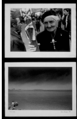
Title: Heroes Date: 1987 Primary Maker: Grace, Tom Medium: Photograph