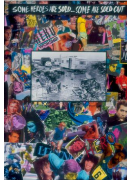
Title: Some Heroes are Sold Some are Sold Out... Date: 1987 Primary Maker: O'Neill, Charlie Medium: Collage